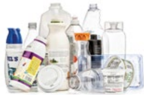
Plastic Bottles, Jugs & Tubs

Every time you choose to recycle, you're giving that item a second life to serve a new purpose and save natural resources. Now more than ever, it's important that only the right items from our Score 4 categories below make their way into your recycling cart, free of contamination.